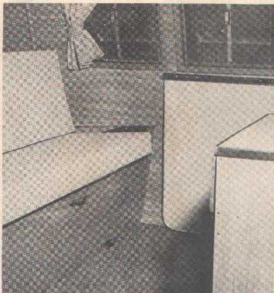
A finely upholstered seat for your passenger's comfort.